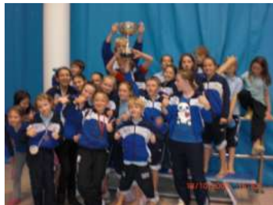
White Rose Champions 2008!!!!