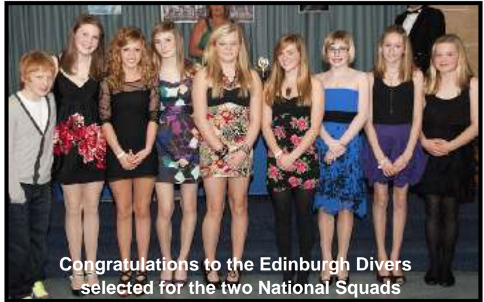
Congratulations to the Edinburgh Divers selected for the two National Squads